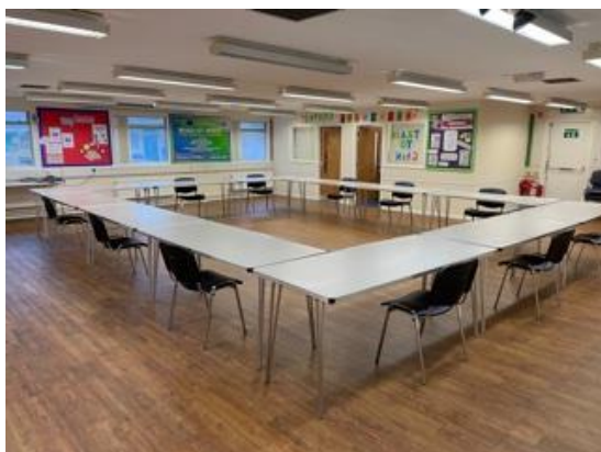
Classroom / Training layout – x25 students