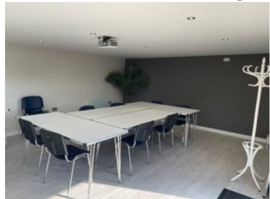
Classroom/Training layout - x12 students